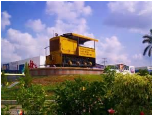
Poza Ria Veracruz

big beautiful polluted clean cheap crowded