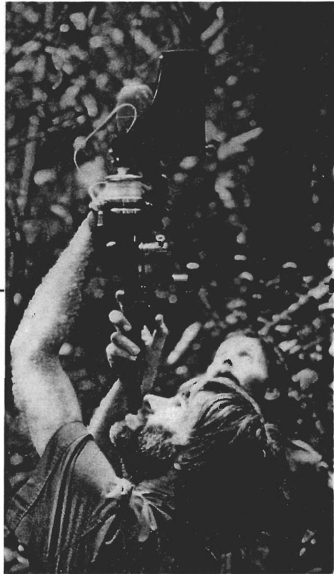
Fig. 2. Line-throwing gun used to establish rope and pulley system in canopy. Attached spinning reel aids in line retrieval.

Briefly, it consists of the following sequence of events. First, forest types at the site are delimited and selected (at the Peru site there are six types of forests). Then 144-m 2 plots are established by locating a tree with large upper branches which will sustain a pulley system; this tree then becomes the north point of the plot. A plot (see plot map, Fig. 1) is established by selection of three more trees with suitable branches which delimit a vertical column with four sides, 12 m to a side, and as high as the canopy top in that particular forest type. This plot is suitably surveyed and marked; perpendicularly, at the middle of each side, a 15-m line is marked off. With the aid of a line-throwing gun (Fig. 2), pulleys are placed as high as possible in the four trees