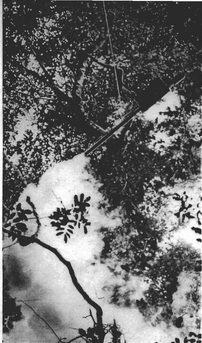
Fig. 3. Radio-controlled Dyna-fog machine in canopy being rotated through 90° angle.

are run at selected sites; for example, sites are refogged a few days later to determine recolonization. Once the set-up is in order for fogging, preparations are made to return to the site early the next day when there is little or no wind blowing. Although the commercial Dyna-fog machine is normally hand operated, I attached a small, radio-controlled servo unit to the on/off lever so that the fog could be automatically turned on while up in the canopy. The radio-controlled fogging machine is started and hoisted into the upper canopy; the fog is turned on by the radio, and it is run for one min at a dial setting of "5" (density of fog) as the fogger is lowered to 15 m above the forest floor.