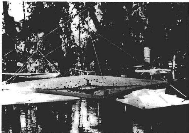
Fig. 4. Sampling tray full of insects at site in Manaus, Brazil.

terra firme forest can be explained partly by the fact that this forest type seems to carry a higher load of smaller species (1-mm class); another possible explanation is the susceptibility of terra firme forests to refugial fractionation during the Tertiary (Prance 1982a), thus providing a greater chance of isolation of gene pools and resultant species formation.