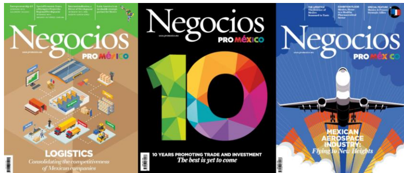
Imagen 4. Portadas de algunas revistas de PROMEXICO

Por otra parte, ambas sedes disponen de revistas especializadas en negocios internacionales que mensualmente proporciona el Director Estatal de PROMEXICO y el Centro de Estudios China- Veracruz –CECHIVER- dispone de un gran acervo bibliográfico especializado en el mercado Chino y como aliado estratégico del posgrado pone a disposición de los estudiantes (imagen 3).