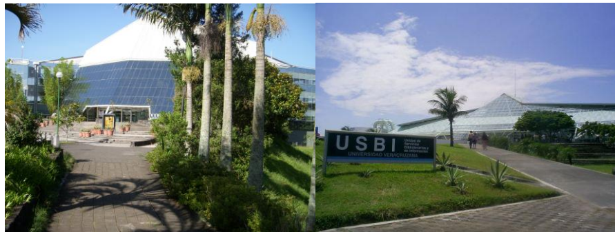
Imagen 1. USBI Xalapa y Veracruz

La Universidad Veracruzana posee en el campus Xalapa y Veracruz, una Unidad de Servicios bibliotecarios y de información donde alberga más de 700 000 títulos, además de contar con salas totalmente equipadas para dar videoconferencias en sus cinco campus de manera simultánea, cuenta con salas de lectura y de cómputo, al mismo tiempo, cuenta con 132.5 kilómetros de fibra óptica permitiendo tener internet inalámbrico para cada uno de sus estudiantes, quienes al momento de ingresar se les crea su cuenta institucional, de la misma manera podrán hacer uso de la base de datos especializada en negocios internacionales con que cuenta la USBI, así como de los libros disponibles en la biblioteca virtual (imagen 1).