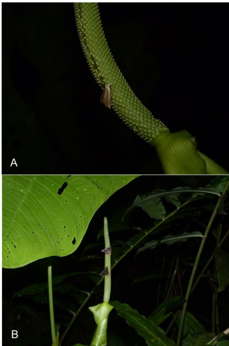
Figure 1. A. The first of two unidentified species of fruit-piercing moths (Erebidae) on a spadix of Anthurium caperatum Croat & R.A. Baker in pistillate anthesis. This individual has its proboscis centered on a stigma, apparently feeding on a stigmatic droplet. B. Two individuals of the second unidentified species of Erebidae moth on another spadix of A. caperatum in pistillate anthesis. along the Río Java trail at Las Cruces Biological Station in San Vito, Puntarenas Province, Costa Rica, June 16th, 2016 around 10 pm local time.