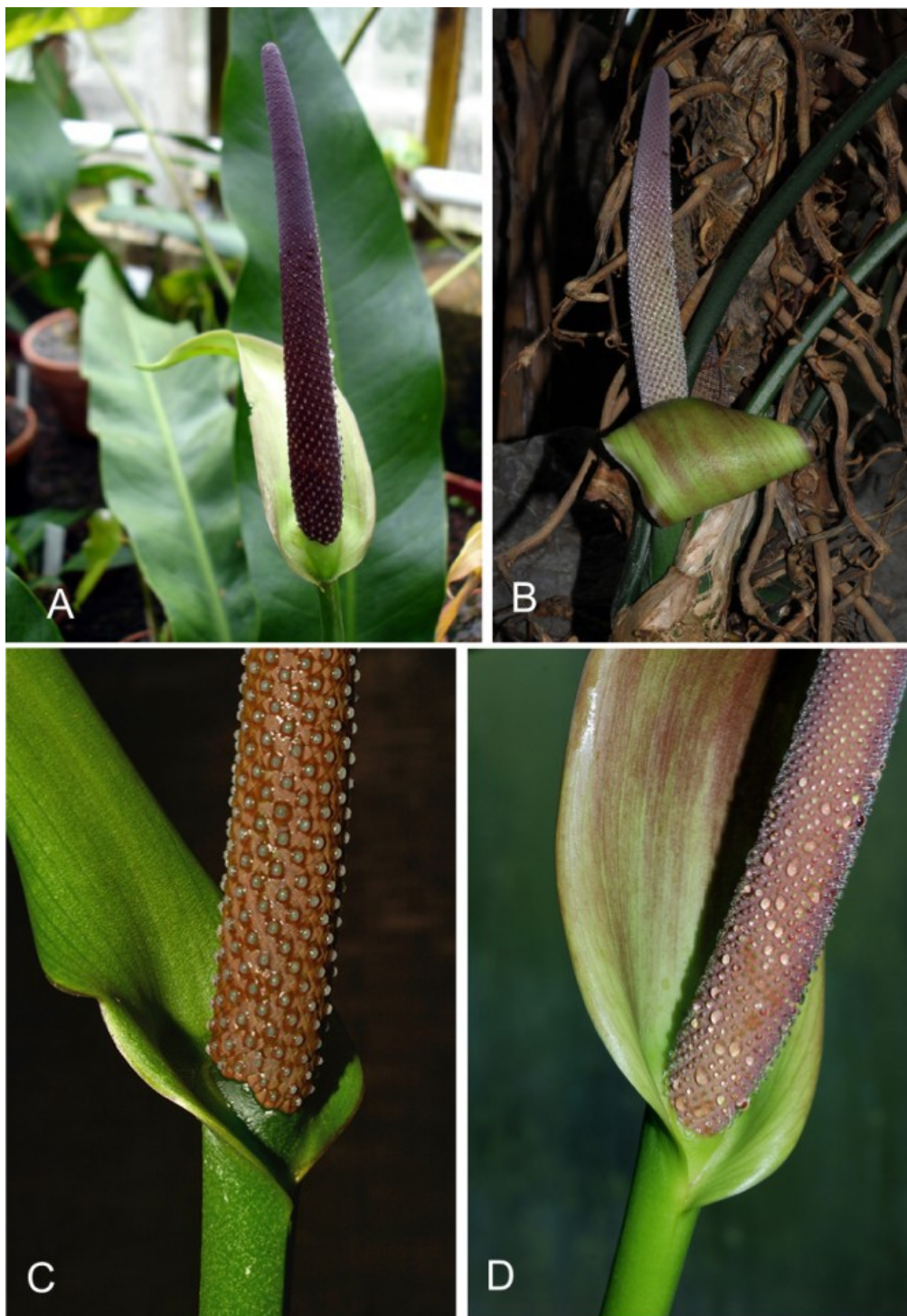
Figure 4. Examples of Anthurium species with conspicuous spadix secretion. A. A. martianum K.Koch & Kolb, Botanical Garden of Munich, Germany. B. A. digitatum (Jacq.) Schott, Botanical Garden of Montreal, Canada. C. A. llewellynii Croat, Botanical Garden of Munich, Germany. D. A. luteynii Croat, Botanical Garden of Lyon, France.