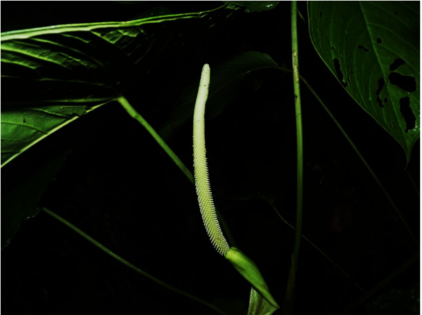
Figure 2. Anthurium caperatum in staminate anthesis, photo taken by N.H. along the same stretch of the Río Java trail as in figure 1. Although this individual also emitted a pungent odor, seemingly equivalent to conspecifics in pistillate anthesis, no visitors were observed.

may thus exist in Anthurium probably in relation to pollination, but this remains to be confirmed by precise studies on the temporal sequence and the composition of spadix secretions in Anthurium .