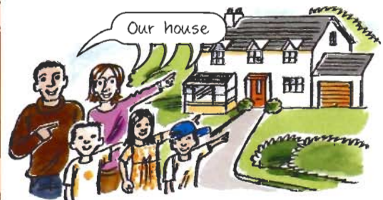
my friends' house = two or more friends (= their house)