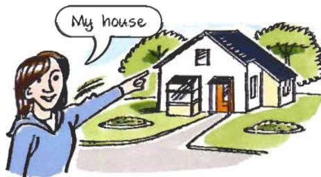
my friend's house = one friend (= his house or her house)