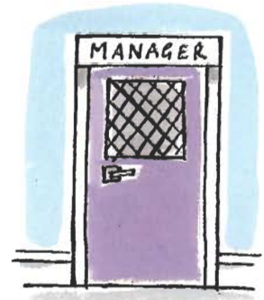
the manager's office (his or her office)