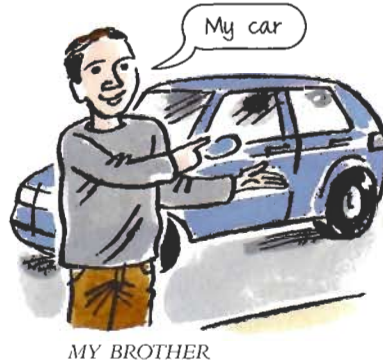
my brother's car (his car)