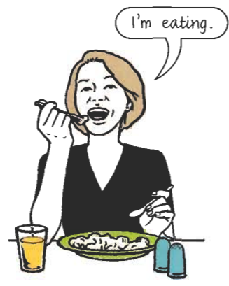
She's eating. She isn't reading.