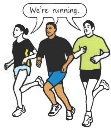
They're running. They aren't walking.

The present continuous is: am/is/are + doing/eating/running/writing etc.