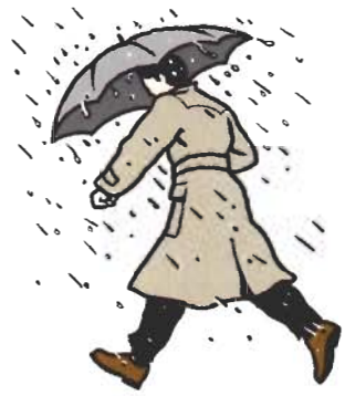
It's raining. The sun isn't shining.